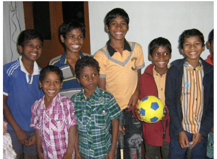
The children with sports equipment, cricket bats, balls, soccer balls, skipping ropes, donated by friends in Minlaton, SA.