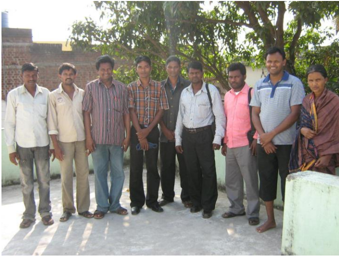
Our team of pastors and office staff