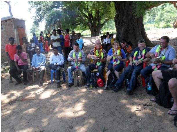
Relaxing indoors & out with fresh drinks, Indian snacks, bananas and biscuits!