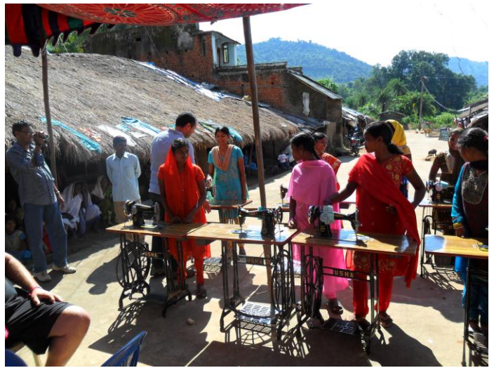
Sewing centre graduation, all of the students were presented with a new sewing machine