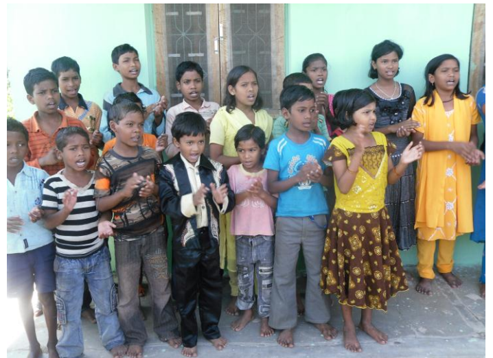
Left: With donated gifts from Australia; Right: hostel children welcoming the Aussie team with a song in Rayagada. The team thoroughly enjoyed their trip to India. They spent almost a week in Rayagada, visiting with the children, village and tribal areas and conducting the sewing centre graduation. Following that, and a very long train trip, they saw some of the incredible history and sights that India has to offer.