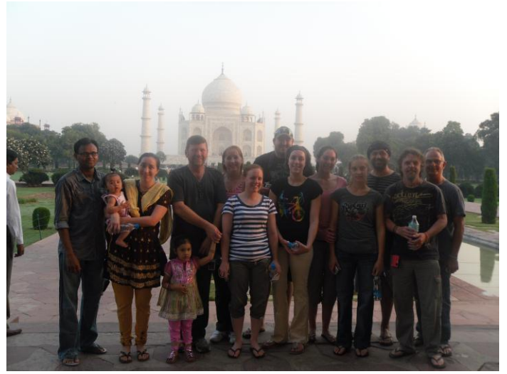
India trip group of 2011, in front of Taj Mahal